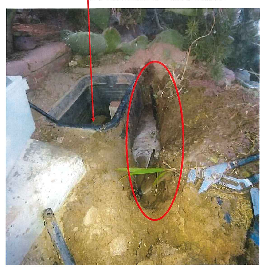
IRRIGATION LINE CUT IN 3 PLACES FROM DONA ANA WATER WORK FOR STOP VALVE REPLACEMENT AT METER BOX.