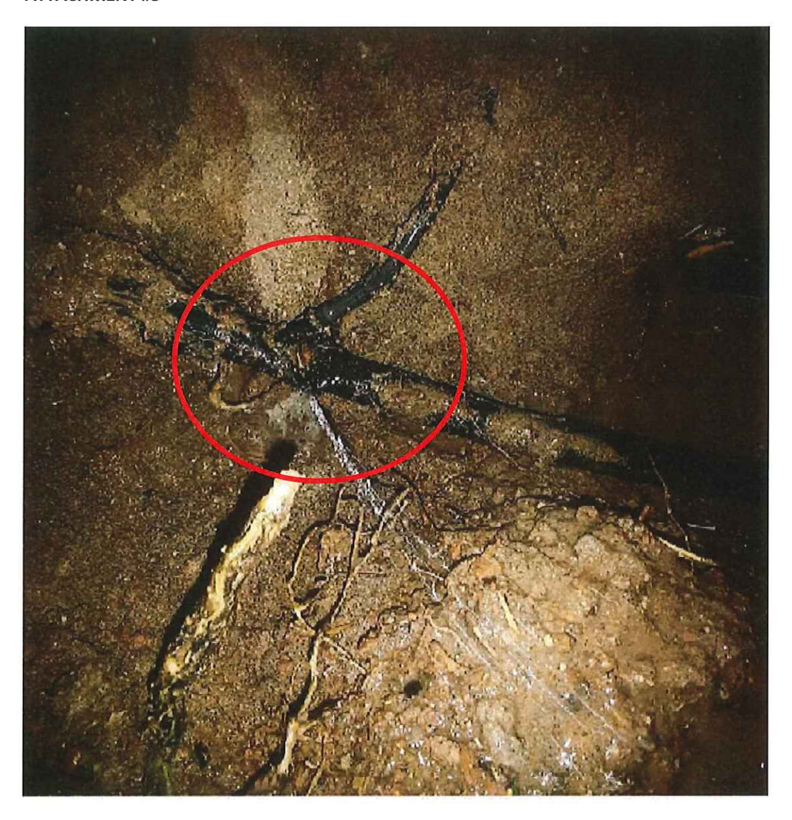
ONE OF THREE SHOVEL CUTS IN IRRIGATION LINE FROM DONA ANA WATER WORK FOR STOP VALVE REPLACEMENT AT METER BOX.